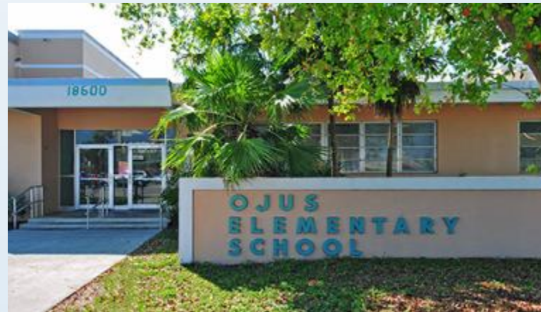
Ojus Elementary is a Title I School.

Federal guidelines require Title I schools to hold an Annual Parent Meeting About the Benefits of the Title I Schoolwide Program to inform parents of Title I requirements and discuss their rights to be involved in the Title I Schoolwide Program.